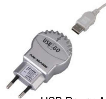
USB Power Adapter